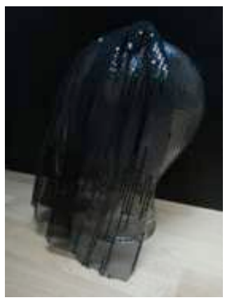
Figure 4 : Chapeau Privée: Mourning the death of privacy.