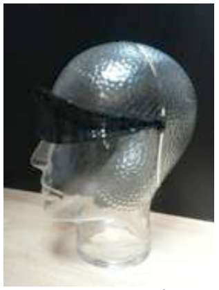
Figure 3: Chapeau Privée: Flexible privacy.