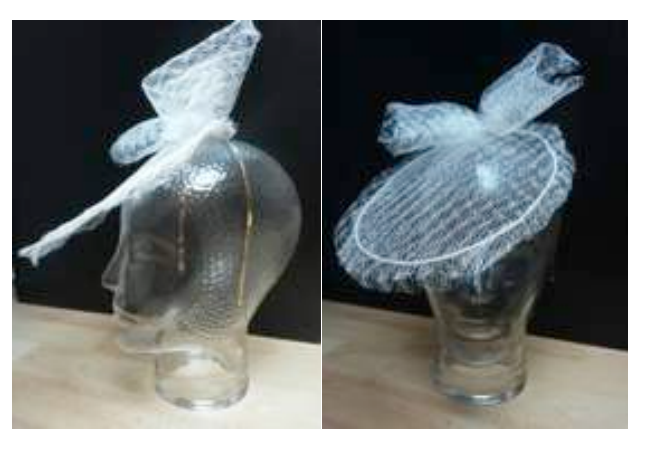
Figure 5: Chapeau Privée: Elegant hiding

Namely, Chapeau Privée explores how everyday citizens could potentially combat surveillance techniques using traditional millinery craft. It is a rather old-fashioned hat-wear collection, designed to protect oneself against CCTV surveillance. Hats (as shown in Figure 3, 4 and 5) are made out of glimmering camouflage and partly recycled material such as tin foil and voile-like techniques. The choice of materials was based on previous work [12] that explored the best surveillance and tracking camouflaging techniques. While it makes novel, surveillance techniques malfunction, it has been made in a traditional way using artisan millinery techniques. Although some facial camouflage techniques already exist (e.g. hoodies, caps [1] and paint [13]), Chapeau privée aims to move away from shady or 'nerdy' connotations and to not make one look overly stand-out in public. The idea of using recycled material in the collection is meant to strengthen its benevolent intent.