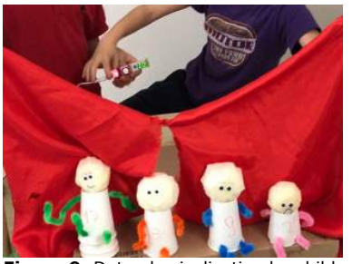
Figure 9 . Data physicalization by children that used the Little Bits for an interactive count-down display. They physicalized how the new pupils felt about their new school.